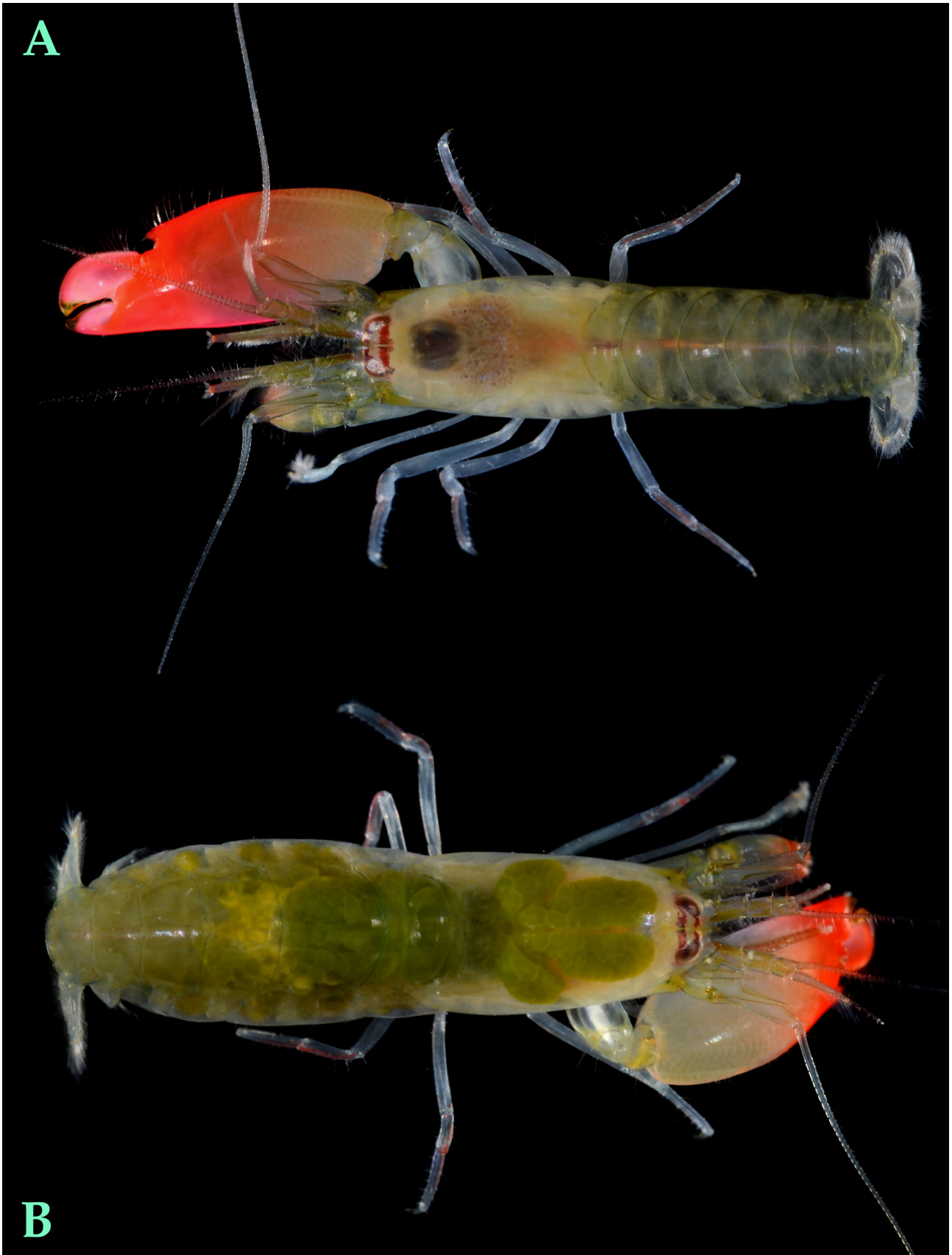
FIGURE 3. Synalpheus pinkfloydi sp. nov., habitus and colour in life: A, holotype male (MZUSP 33778); B, paratype female (MZUSP 34615), Las Perlas Archipelago, Panama.